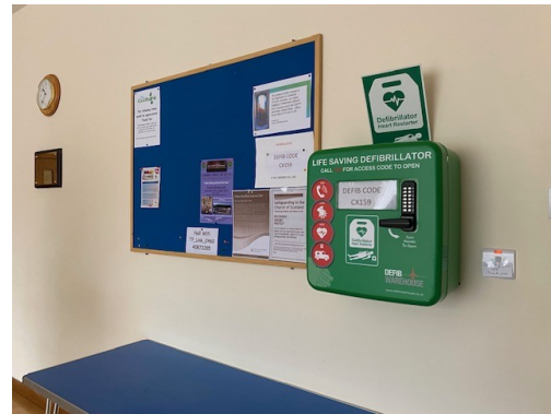
The Fellowship Area