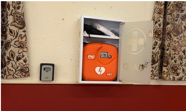
The North Hall

There are now a number of defibrillators located round the church, below are the locations: