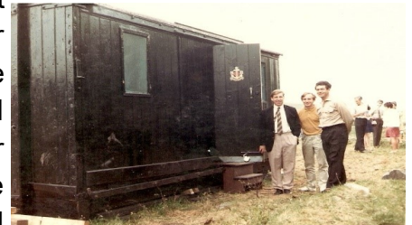
Charlie on the first day on site