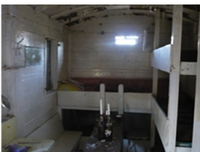
The inside of Charlie when I visited (Feb '08)