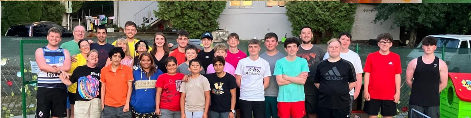
The Herald Castlehill Parish Church Autumn 2024